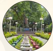
Azad Park, Prayagraj