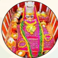
Hanuman ji, Prayagraj